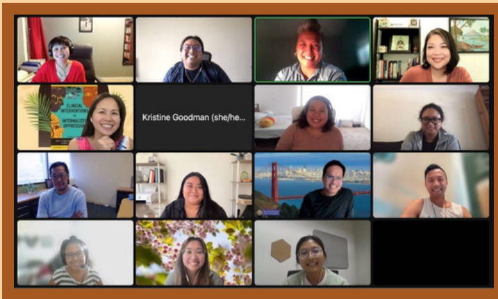
APA 2022 Division on Filipinx Americans

REMEMBERING OUR ELDERS, RESTORING OUR SOULS, SCHOLARSHIP AND COLLABORATION FOR THE NEXT 50 YEARS