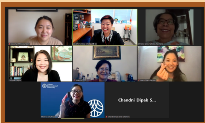
APA 2022 Division on Women