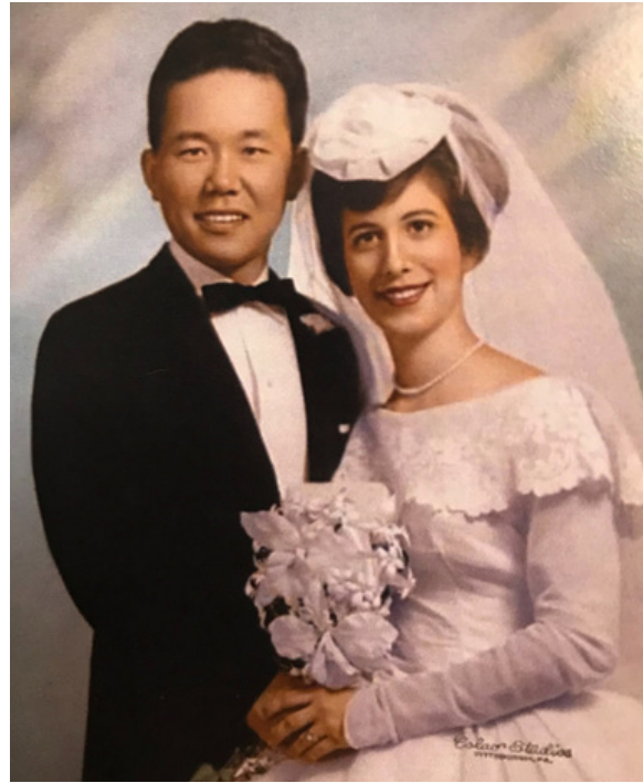
Wedding photo from 1962 of my dad wearing a black tuxedo and my mom in a white wedding gown with a white hat and veil and holding white flowers, both smiling.