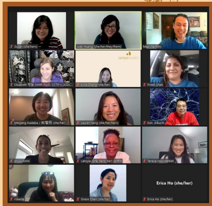
APA 2022 Division on Practice